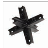
6-way corner joint