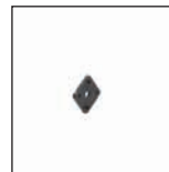
Plastic shelf spacer