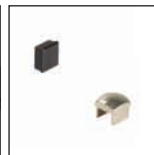
End caps - plastic or metal