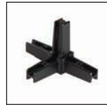
4-way corner joint