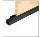
Cladding and glazing extrusions