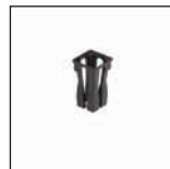
Black, White or Clear Inserts