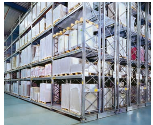
P90 for fast-moving seasonal items.