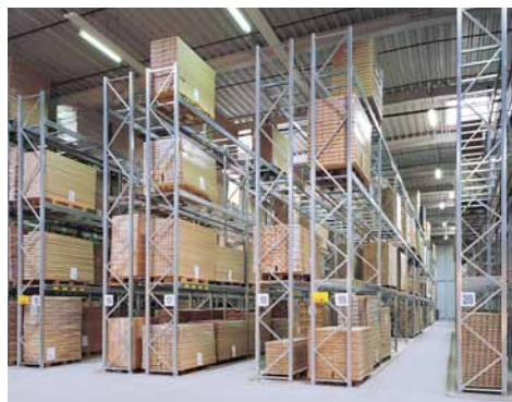
P90 drive-in racks can make up to 90% more storage space compared to conventional pallet racking systems.