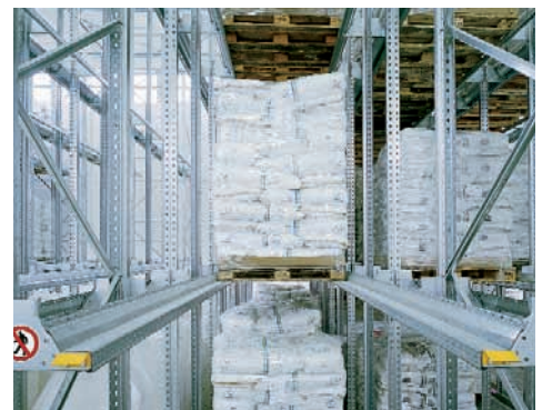
This smoothly formed pallet-carrying rail offers a safe, snag free surface. Pallet rails are carried on brackets that slot into the upright at 50mm pitch and are pin-locked in position.