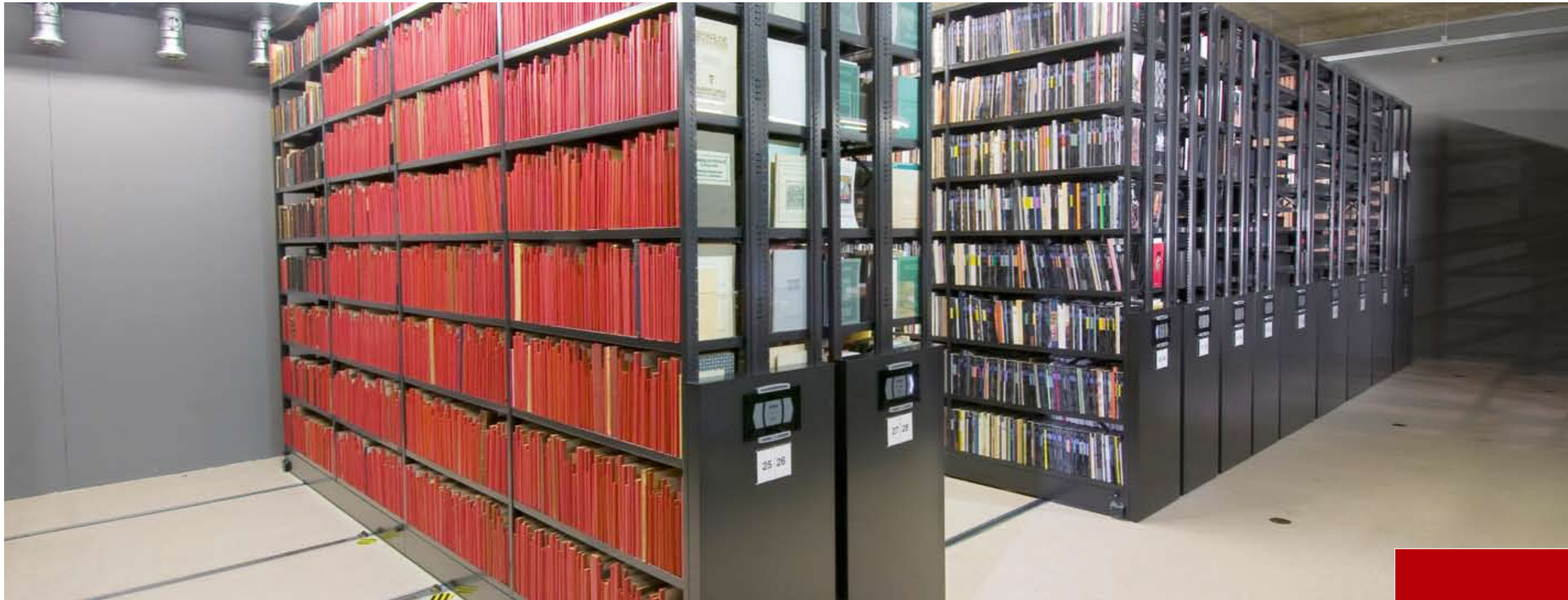
Boijmans Van Beuningen

Bruynzeel is a market leader when it comes to Corporate Social Responsibility, and this means that Corporate Social Responsibility not only forms part of our day-to-day business but also relates to our products themselves. We would be pleased to assist you in achieving your goals in the area of sustainability by offering you durable products and saving floor space. We can also contribute towards creating a pleasant environment with our flexible design solutions.