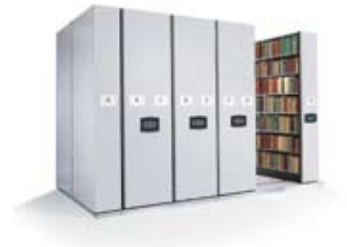
Compactus® Power 3