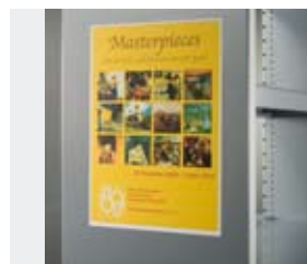
Magnetic Sheet A4