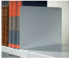
Book Support full depth