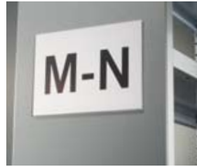
Label Holder A5 - A6